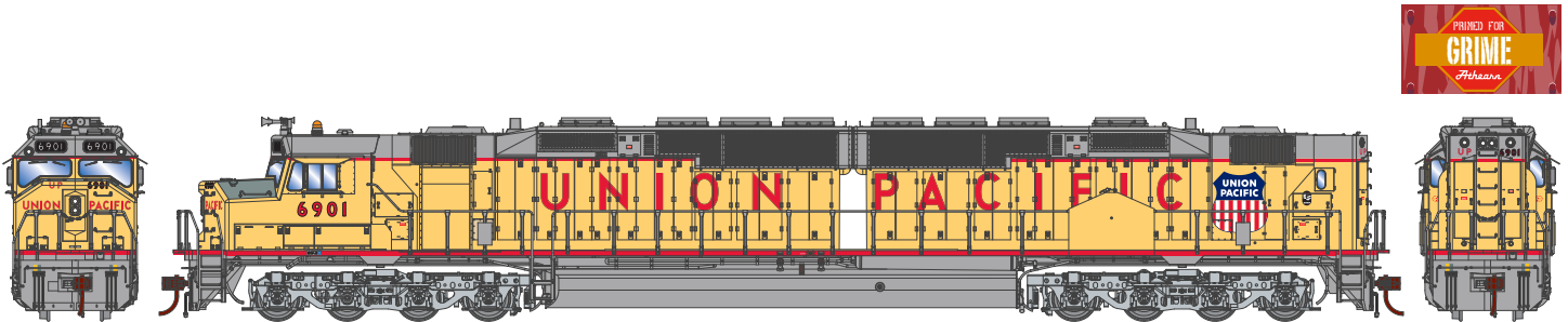
Era: Late 1970's - Early 1980's