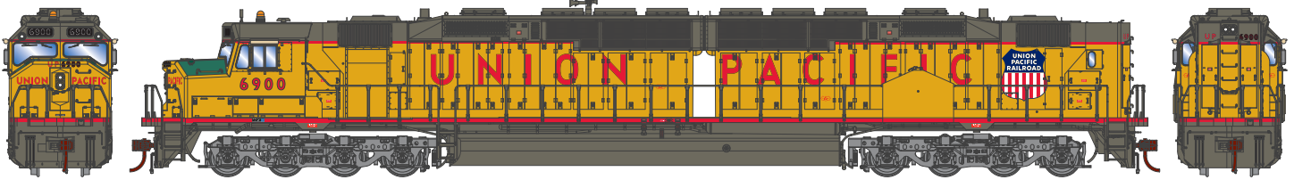
Era: 1969 - Early 1970s