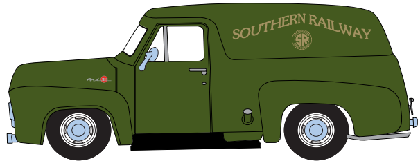
___ 26492 Southern $12.98