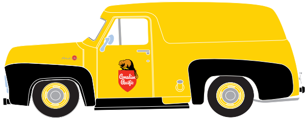
___ 26489 Canadian Pacific $12.98