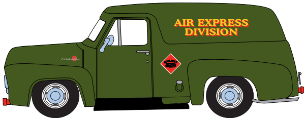
___ 26490 Railroad Express Agency $12.98