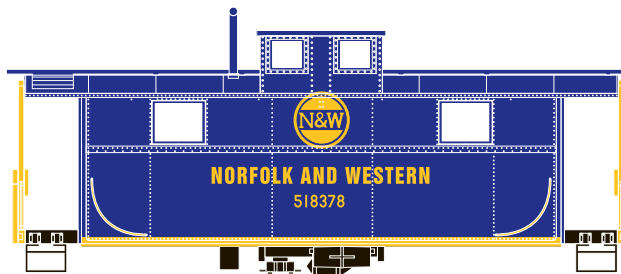
___ 74279 N&W #518378