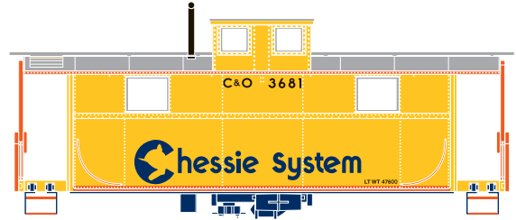
___ 74276 Chessie #3681