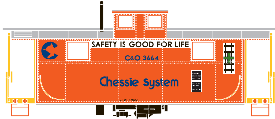
___ 74275 Chessie #3664