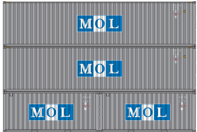
27897 MOL 2-20' & 2-40' (RERUN) $29.98