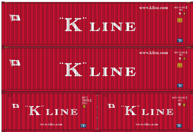
27895 K-Line 2-20' & 2-40' (RERUN) $29.98