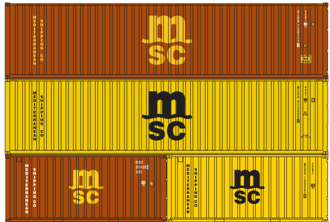
27898 MSC 2-20' & 2-40' (RERUN) $29.98