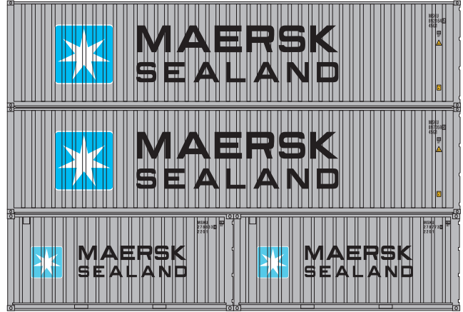
27896 Maersk Sealand 2-20' & 2-40' (RERUN) $29.98