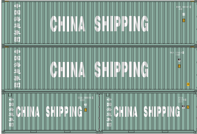
27893 China Shipping 2-20' & 2-40' (RERUN) $29.98