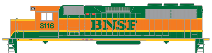
___ 77865 GP50 Ph II BNSF #3116 $79.98 ___ 77866 GP50 Ph II BNSF #3196 $79.98