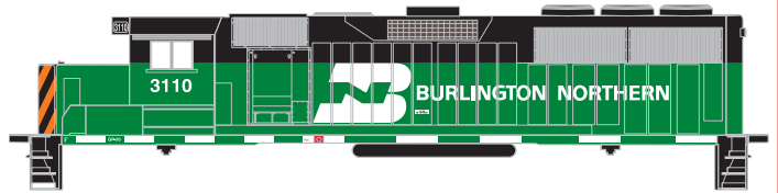
___ 77863 GP50 Ph II BN Tiger Stripe #3110 $79.98 ___ 77864 GP50 Ph II BN Tiger Stripe #3140 $79.98