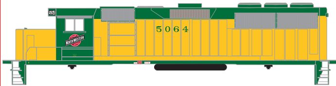
___ 77845 GP50 C&NW #5064 $79.98* ___ 77846 GP50 C&NW #5071 $79.98*