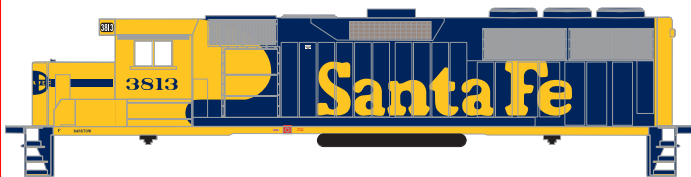
___ 77847 GP50 Santa Fe #3813 $79.98 ___ 77848 GP50 Santa Fe #3822 $79.98