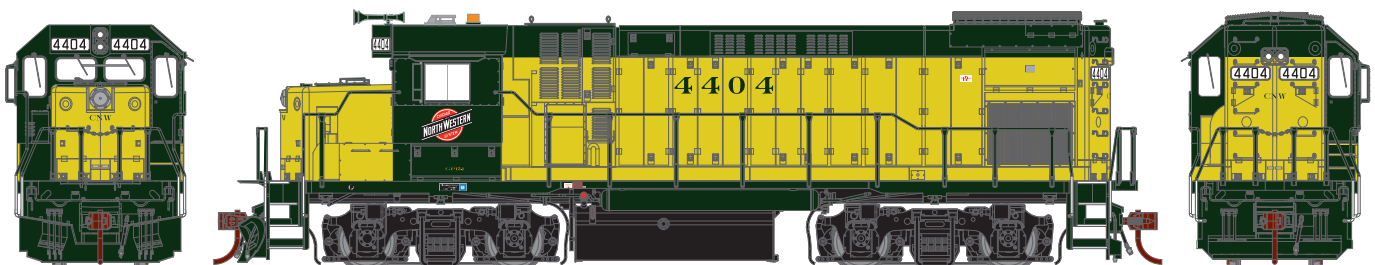
___ G68046 No Sound $189.98* ___ G68146 Sound $289.98* GP15-1 Chicago & North Western #4404