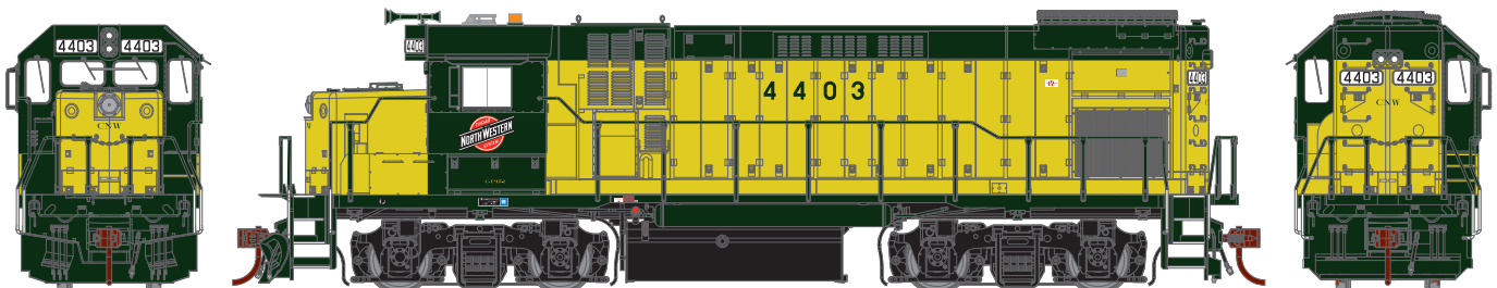
___ G68045 No Sound $189.98* ___ G68145 Sound $289.98* GP15-1 Chicago & North Western #4403