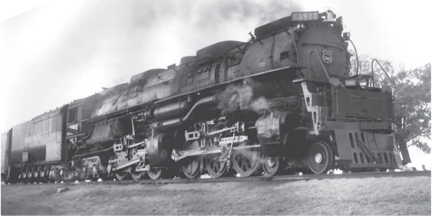
Era: 1940s - 1980s

This stunning reproduction of the 4-6-6-4 Challenger is the result of a focused determination to accomplish one thing: create the finest operating miniature representation of the prototype available. To say Athearn has succeeded would be an understatement. Giving life to all the details are authentic sounds that are channeled through a factory installed DCC and soundboard with speakers. The DCC decoder automatically senses what type of power supply is in use (conventional DC or NMRA compliant DCC) and adapts its functions. The modeler doesn't have to do a thing.