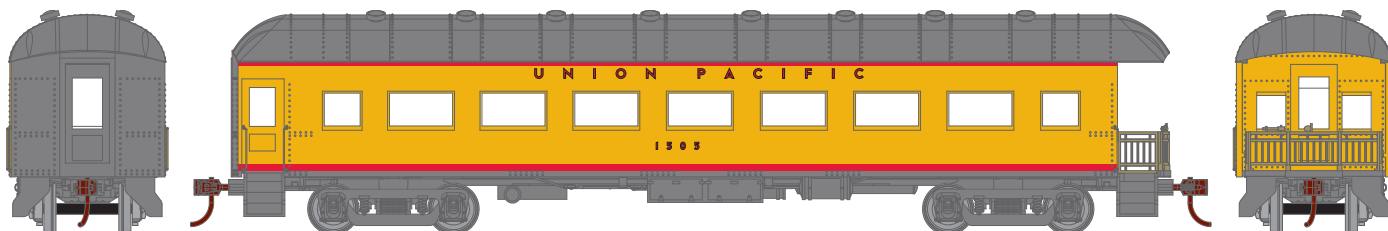
___ 86632 UNION PACIFIC #1505 (YELLOW) $44.98*

ERA: 1930s TO 1950s WITH THE MODEL DIE CASTING TOOLING AS THE FOUNDATION, WE HAVE MADE EXTENSIVE UP-GRADERS TO BRING YOU THESE FINE MODELS. ▸ NEW STIRRUP STEPS ▸ FULLY ASSEMBLED ▸ SEPARATE GRAB IRONS ▸ WEIGHTED FOR OPTIMUM PERFORMANCE ▸ MCHENRY® SCALE KNUCKLE SPRING COUPLERS ▸ 2 OR 3-AXLE TRUCKS, PER PROTOTYPE ▸ RAZOR SHARP PAINT AND PRINTING ▸ REMOVABLE ROOF-HELD WITH MAGNETS ▸ MACHINED 33" METAL RP25 PROFILE WHEELS ▸ RPO COMES WITH MAIL HOOK DETAILS, BOTH SIDES ▸ WINDOW GLAZING ▸ VESTIBULE PARTITIONS