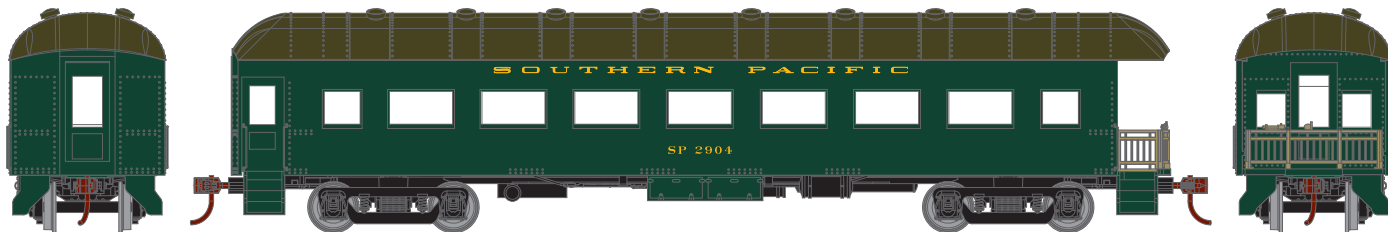
___ 86631 SOUTHERN PACIFIC #2904 (GREEN) $44.98*