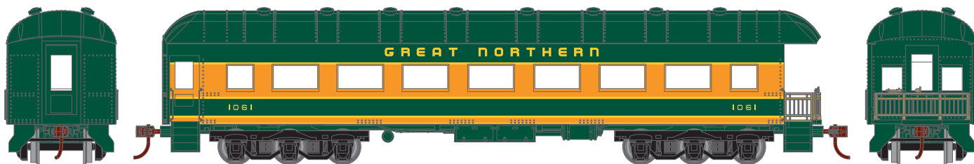
___ 86630 GREAT NORTHERN #1061 $44.98