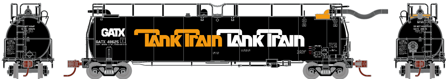
ATH15020 N TankTrain Intermediate, GATX/Now/Early #48625