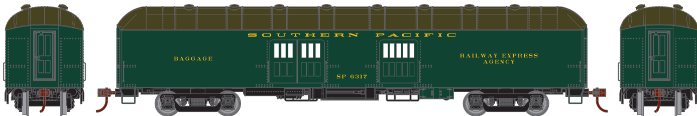
___ 86531 SOUTHERN PACIFIC #6317 (GREEN) $44.98*