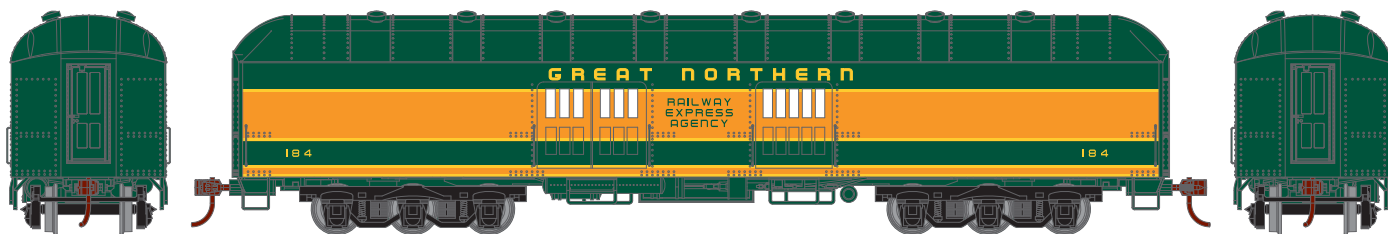
___ 86530 GREAT NORTHERN #184 $44.98