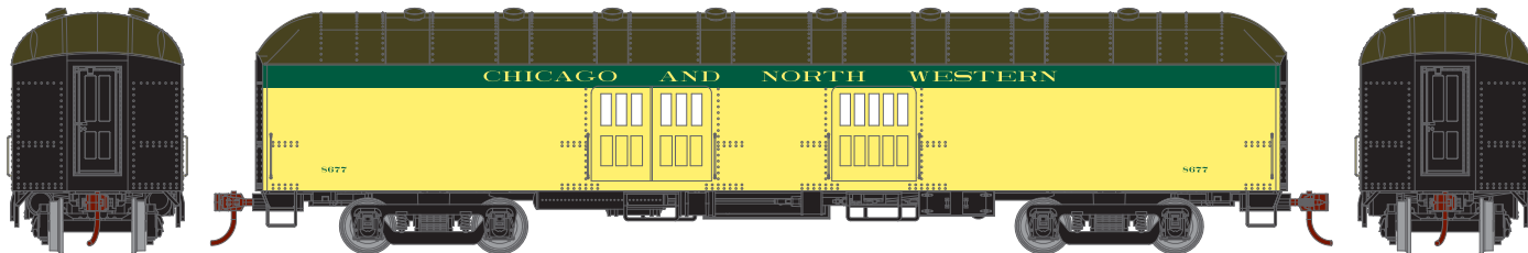
___ 86529 CHICAGO & NORTHWESTERN #8677 $44.98