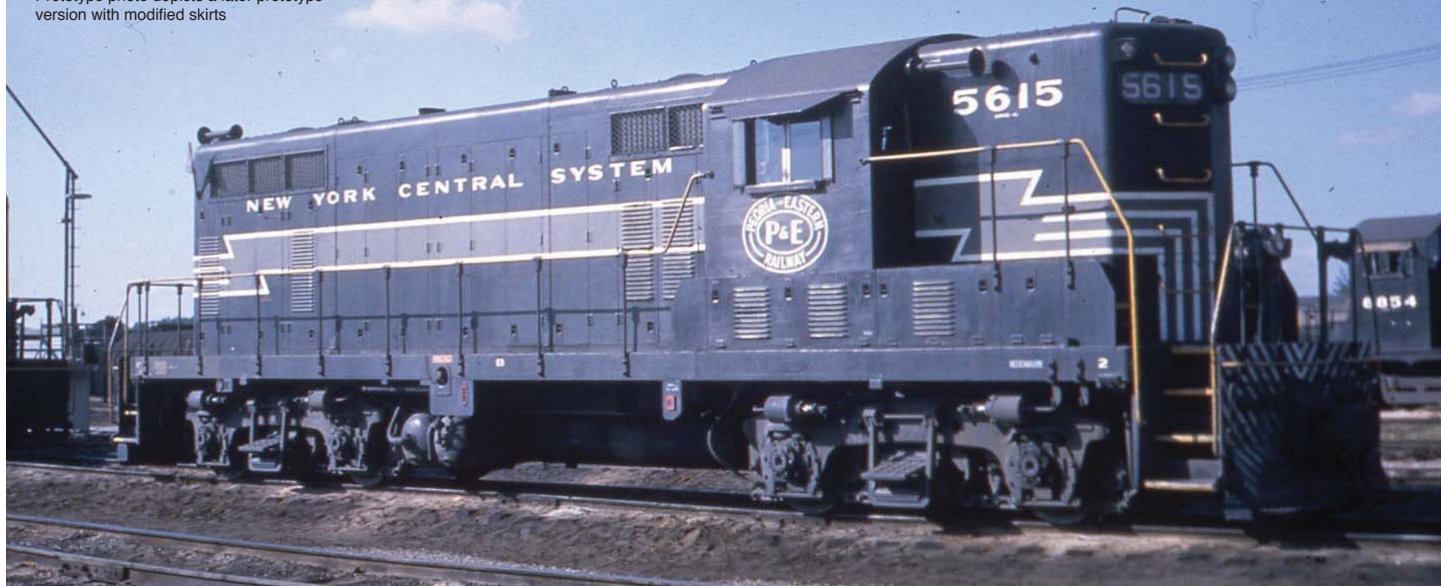
Prototype photo depicts a later prototype version with modified skirts