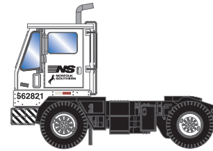
ATH39012 NS #562821