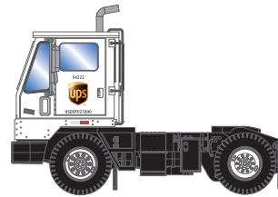
ATH39014 UPS #54222