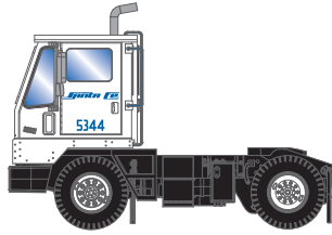
ATH39009 ATSF #5344