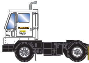
ATH39011 JB Hunt #10757