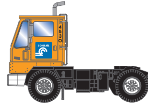
ATH39010 CR #4530