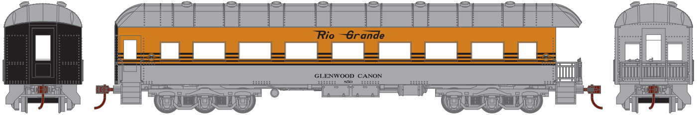
___ 86633 RIO GRANDE #850 "GLENWOOD CANON" $39.98*