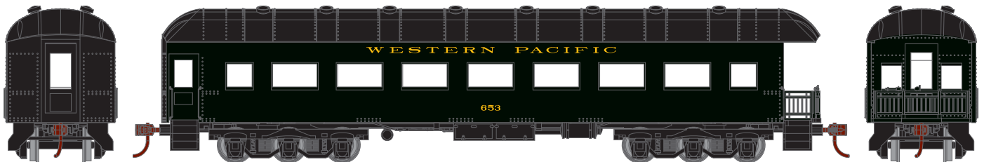
___ 86636 WESTERN PACIFIC #653 $39.98*

ERA: 1930s TO 1950s WITH THE MODEL DIE CASTING TOOLING AS THE FOUNDATION, WE HAVE MADE EXTENSIVE UP-GRADERS TO BRING YOU THESE FINE MODELS. • NEW STIRRUP STEPS • FULLY ASSEMBLED • SEPARATE GRAB IRONS • WEIGHTED FOR OPTIMUM PERFORMANCE • MCHENRY® SCALE KNUCKLE SPRING COUPLERS • 2 OR 3-AXLE TRUCKS, PER PROTOTYPE • RAZOR SHARP PAINT AND PRINTING • REMOVABLE ROOF-HELD WITH MAGNETS • MACHINED 33" METAL RP25 PROFILE WHEELS • RPO COMES WITH MAIL HOOK DETAILS, BOTH SIDES • WINDOW GLAZING • VESTIBULE PARTITIONS