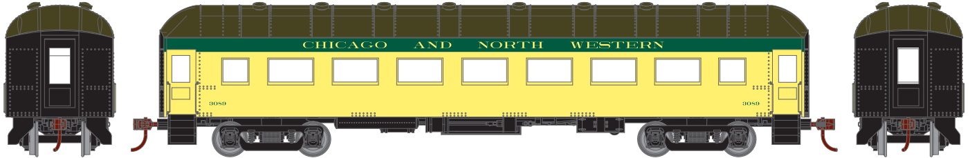
___ 86589 CHICAGO & NORTHWESTERN #3089 $44.98 ___ 86609 CHICAGO & NORTHWESTERN #3136 $44.98