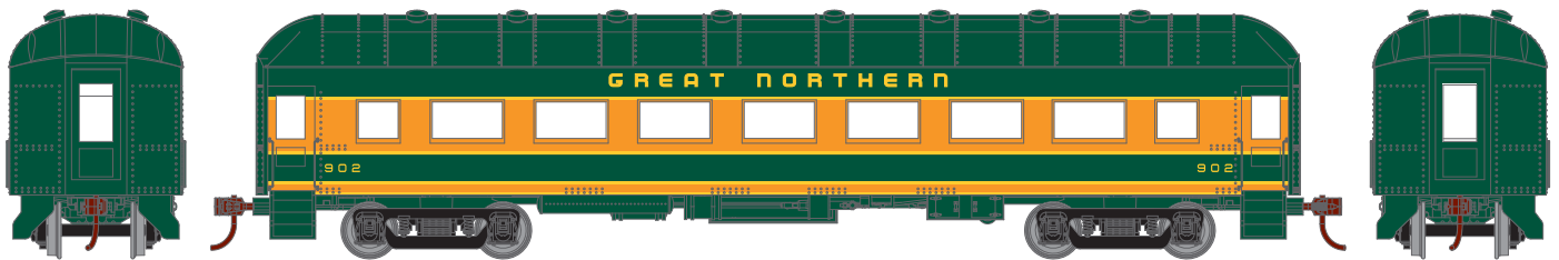
___ 86590 GREAT NORTHERN #902 $44.98 ___ 86610 GREAT NORTHERN #907 $44.98