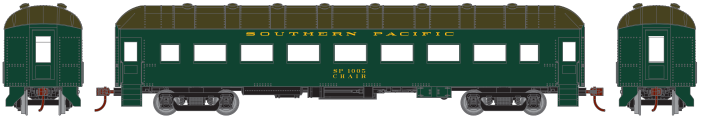
___ 86591 SOUTHERN PACIFIC #1005 (GREEN) $44.98* ___ 86611 SOUTHERN PACIFIC #1009 (GREEN) $44.98*