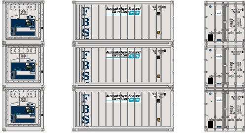
ATH28848 HO RTR 20' Reefer Container, ANZ (3-PACK)