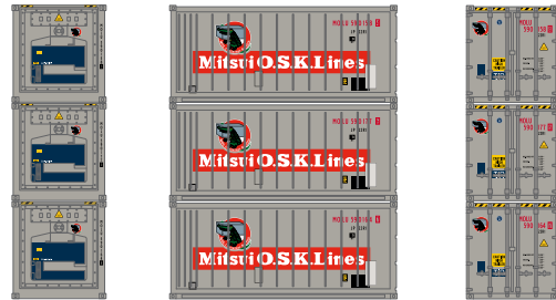
ATH28851 HO RTR 20' Reefer Container, MOLU (3-PACK)