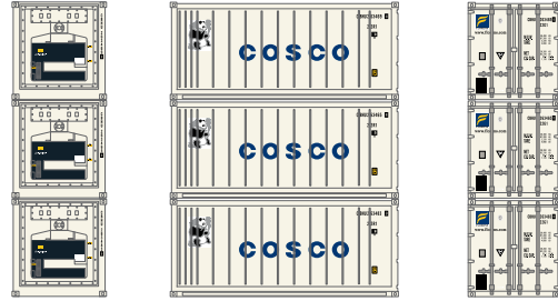
ATH28849 HO RTR 20' Reefer Container, Cosco (3-PACK)