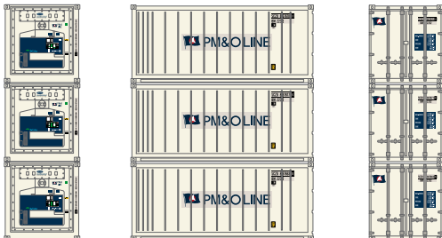
ATH28852 HO RTR 20' Reefer Container, PM&O (3-PACK)