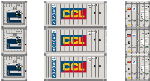
ATH28850 HO RTR 20' Reefer Container, Cronos/CCL (3-PACK)