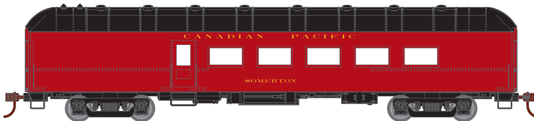
___ 86561 CANADIAN PACIFIC - SOMERTON $39.98