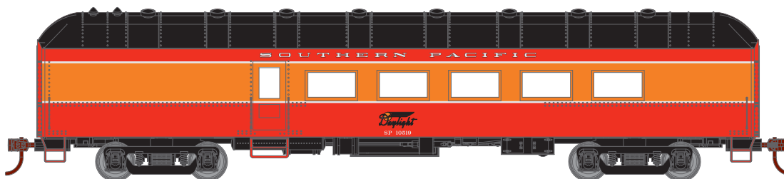
___ 86563 SOUTHERN PACIFIC DAYLIGHT #10519 $39.98*