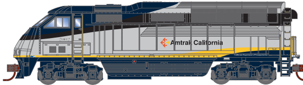
DCC Ready ATH15307 ATH15308