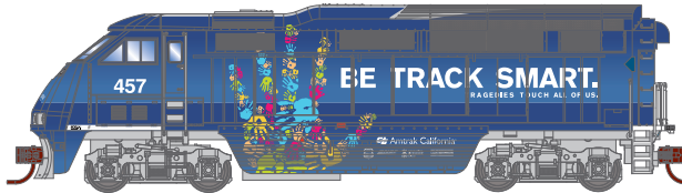
DCC Ready ATH15298