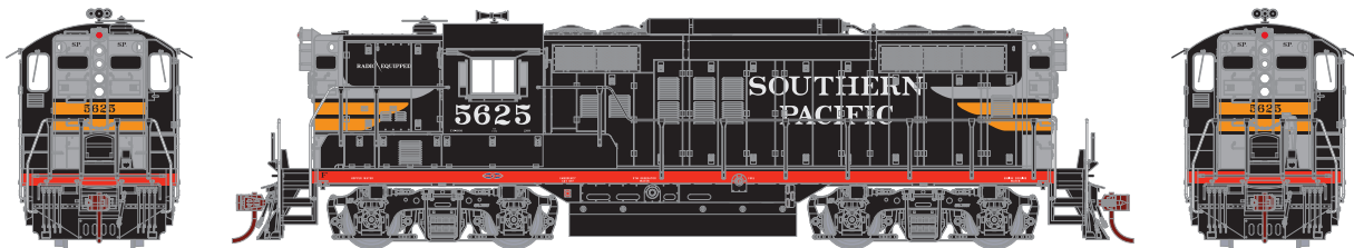
___ G62542 No Sound $189.98* ___ G62742 Sound $289.98* GP9 SP #5625