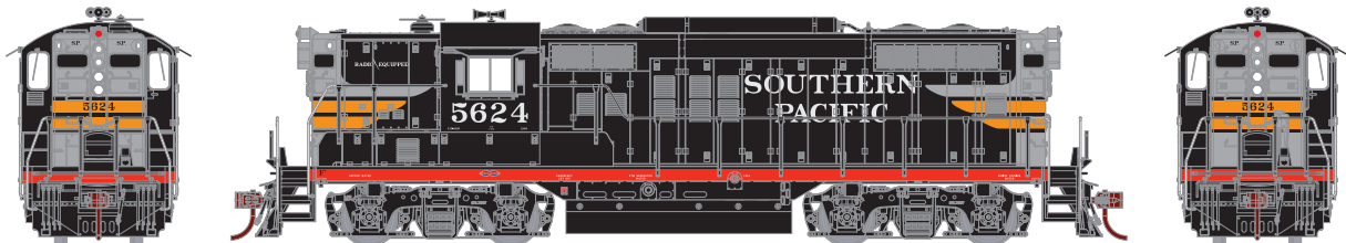
___ G62541 No Sound $189.98* ___ G62741 Sound $289.98* GP9 SP #5624