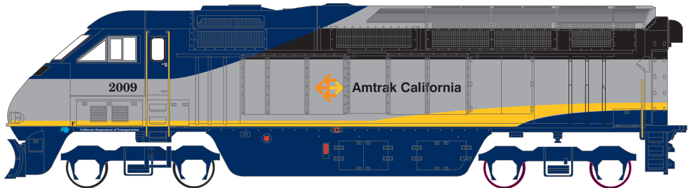
___ 26328 Amtrak California #2009 $89.98 ___ 26329 Amtrak California #2014 $89.98