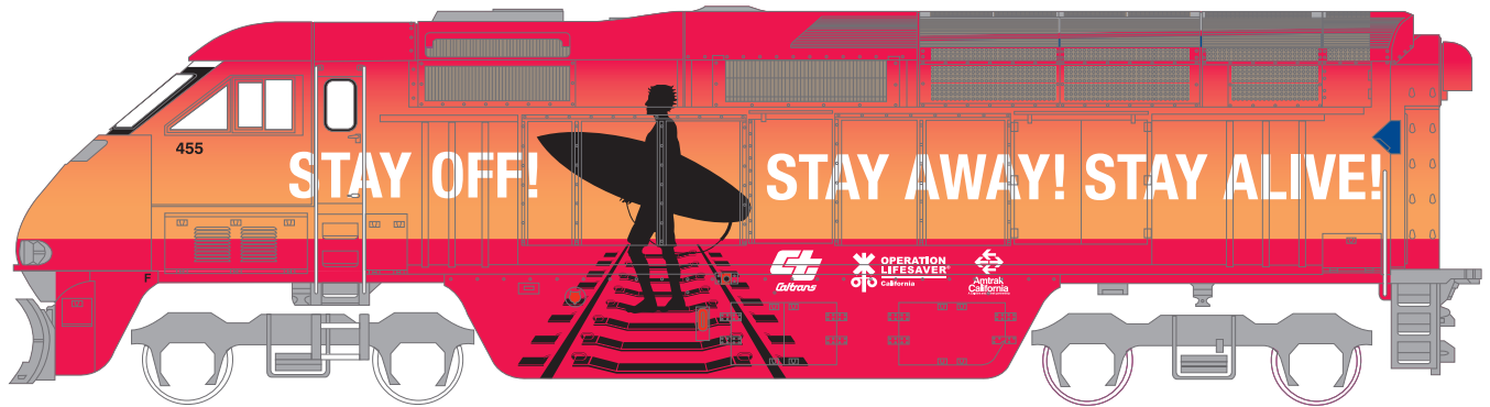
___ 26315 Amtrak #455 Operation Life Saver $99.98