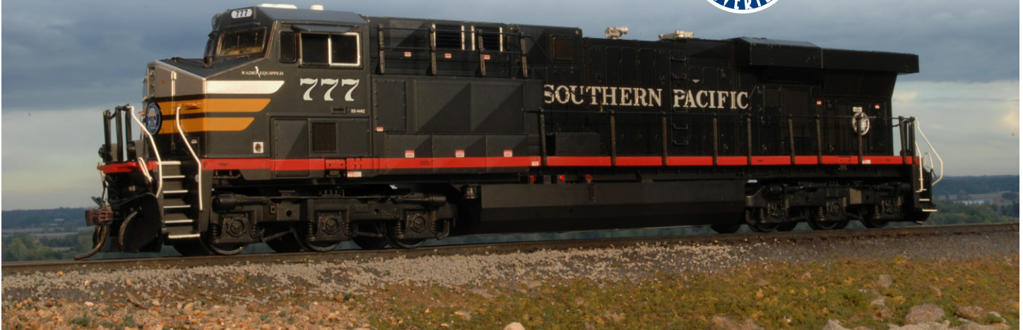
Pre-production model shown

NOW EQUIPPED WITH: LEDs, & RUBBER MU HOSES