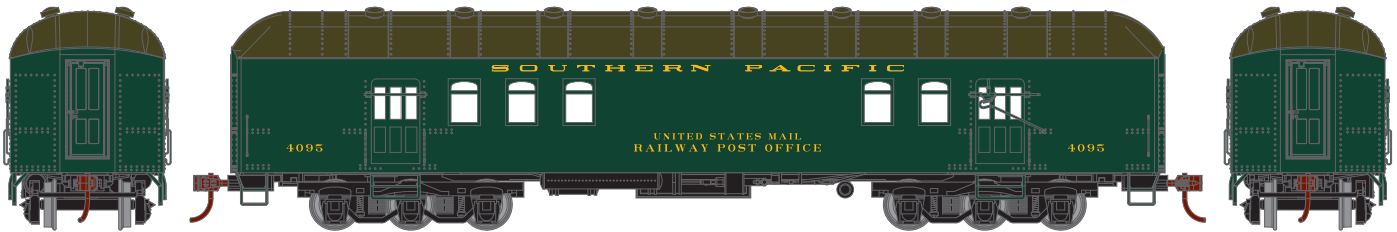
___ 86511 SOUTHERN PACIFIC #4095 (GREEN) $44.98*