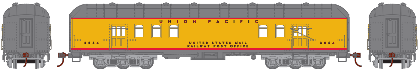
___ 86512 UNION PACIFIC #2064 (YELLOW) $44.98*

ERA: 1930s TO 1950s WITH THE MODEL DIE CASTING TOOLING AS THE FOUNDATION, WE HAVE MADE EXTENSIVE UP-GRADERS TO BRING YOU THESE FINE MODELS. ▸ NEW STIRRUP STEPS ▸ FULLY ASSEMBLED ▸ SEPARATE GRAB IRONS ▸ WEIGHTED FOR OPTIMUM PERFORMANCE ▸ MCHENRY® SCALE KNUCKLE SPRING COUPLERS ▸ 2 OR 3-AXLE TRUCKS, PER PROTOTYPE ▸ RAZOR SHARP PAINT AND PRINTING ▸ REMOVABLE ROOF-HELD WITH MAGNETS ▸ MACHINED 33" METAL RP25 PROFILE WHEELS ▸ RPO COMES WITH MAIL HOOK DETAILS, BOTH SIDES ▸ WINDOW GLAZING ▸ VESTIBULE PARTITIONS