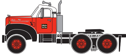
___ 12181 CB&Q (RERUN) $19.98