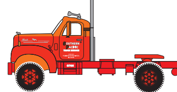
___ 12184 Southern Pacific (RERUN) $19.98*