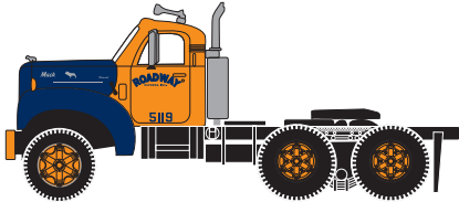
___ 12182 Roadway (RERUN) $19.98