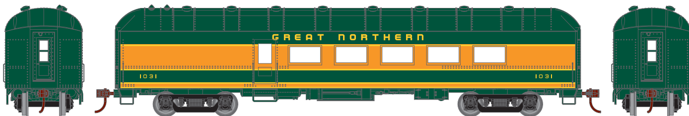
___ 86570 GREAT NORTHERN #1031 $44.98