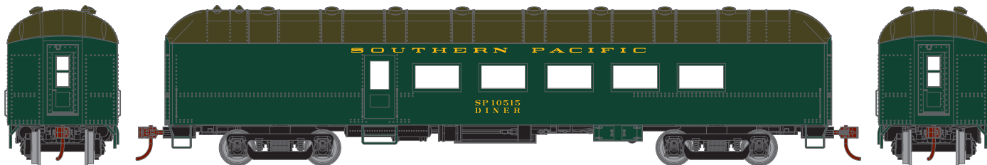
___ 86571 SOUTHERN PACIFIC #10515 (GREEN) $44.98*