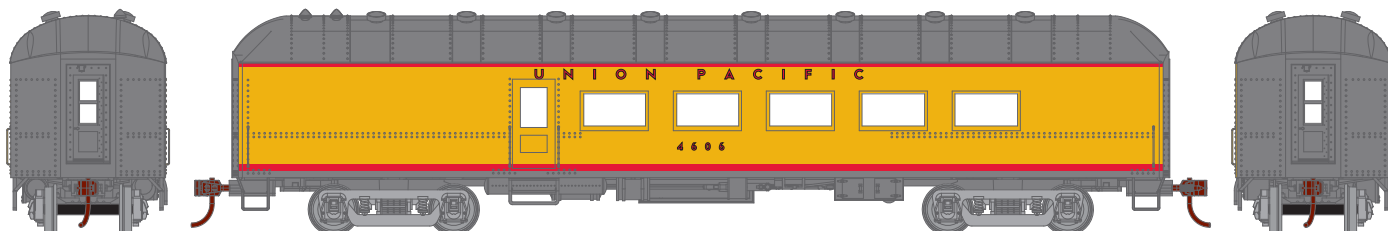
___ 86572 UNION PACIFIC #4606 (YELLOW) $44.98*