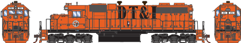
Era: Late 1970s+