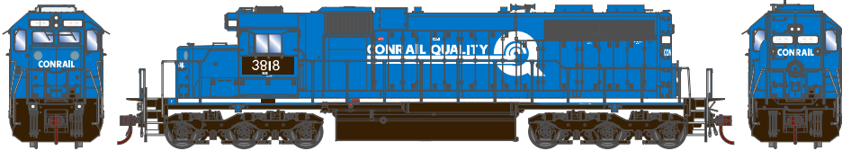
Era: 2009 +