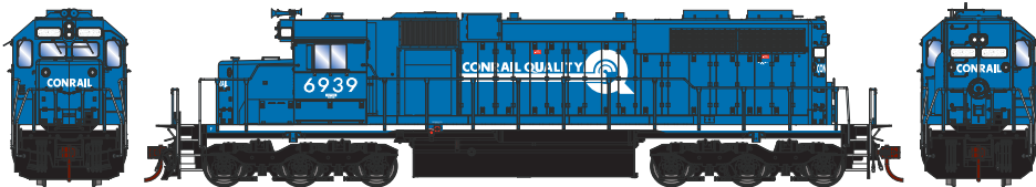
Era: Mid 1990s+