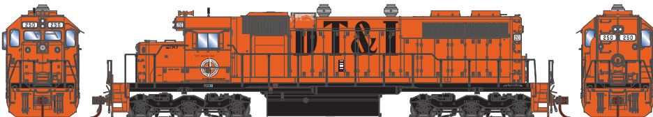
Era: Early 1980s+