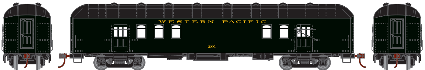
___ 86516 WESTERN PACIFIC #201 $39.98*

ERA: 1930s TO 1950s WITH THE MODEL DIE CASTING TOOLING AS THE FOUNDATION, WE HAVE MADE EXTENSIVE UP-GRADERS TO BRING YOU THESE FINE MODELS. • NEW STIRRUP STEPS • FULLY ASSEMBLED • SEPARATE GRAB IRONS • WEIGHTED FOR OPTIMUM PERFORMANCE • MCHENRY® SCALE KNUCKLE SPRING COUPLERS • 2 OR 3-AXLE TRUCKS, PER PROTOTYPE • RAZOR SHARP PAINT AND PRINTING • REMOVABLE ROOF-HELD WITH MAGNETS • MACHINED 33" METAL RP25 PROFILE WHEELS • RPO COMES WITH MAIL HOOK DETAILS, BOTH SIDES • WINDOW GLAZING • VESTIBULE PARTITIONS