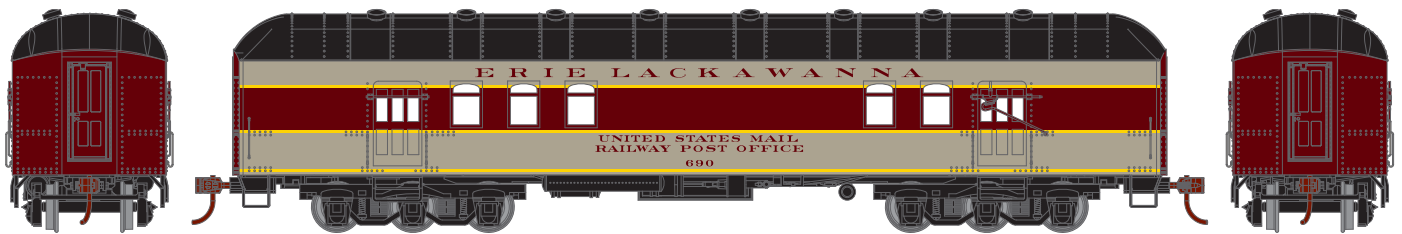
___ 86514 ERIE LACKAWANNA #690 $39.98