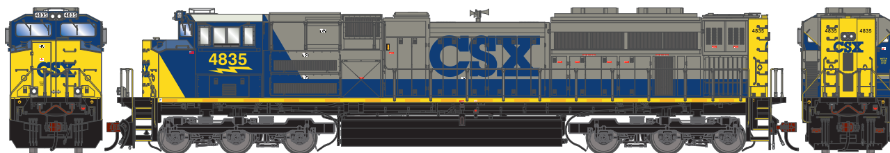
Era: Mid 2007+ (alternate history)