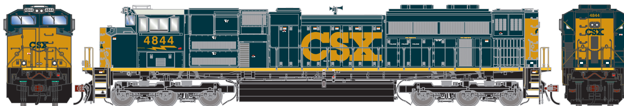
Era: Mid 2004+