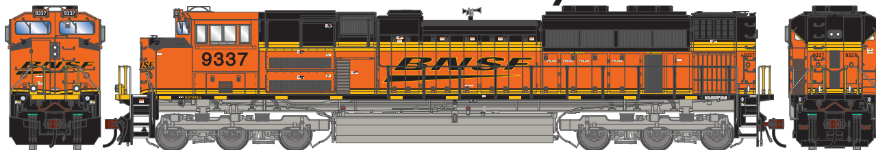
Era: Mid 2006+