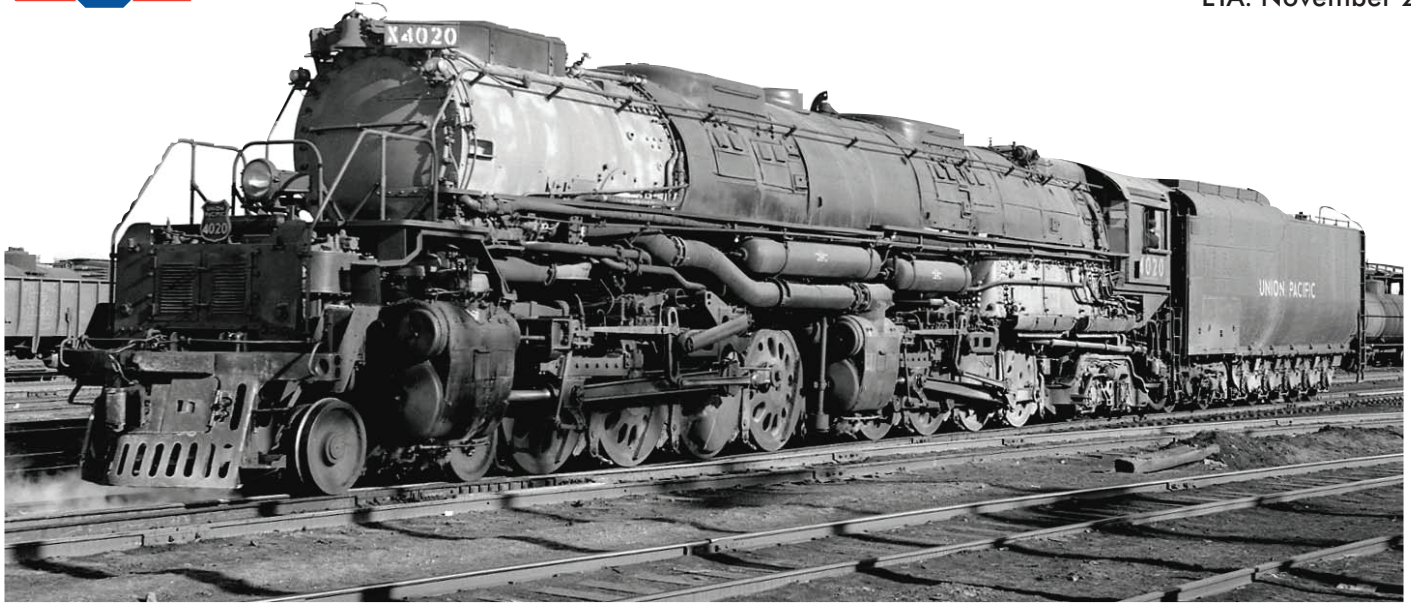
Era: 1940s - 1960s