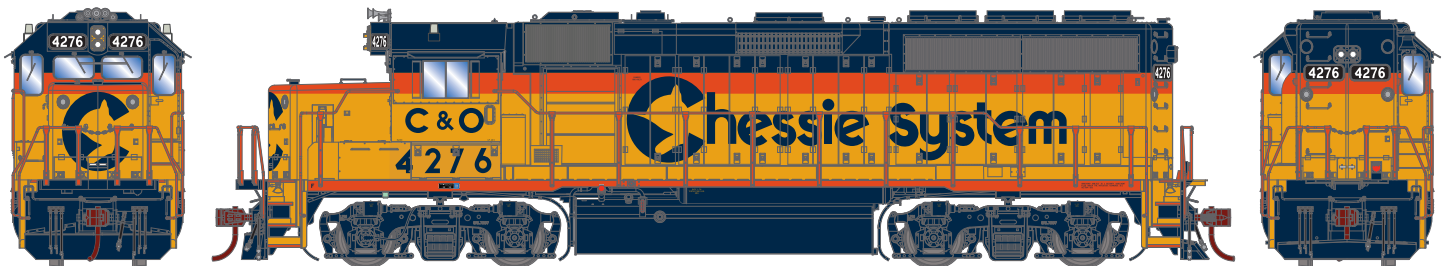
GP40-2, C&O #4276

without Sound ATHG65075 with Sound ATHG65175